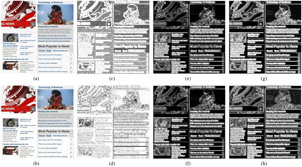
Fig. 1. Two exemplary distorted screen images associated with the same reference one: (a) White noise, DMOS = 46.042, SSIM = 0.7380, SIQM = 0.9738; (b) JPEG2000 compression, DMOS = 69.397, SSIM = 0.8405, SIQM = 0.9523; (c)-(d) SSIM distortion maps of (a)-(b); (e)-(f) Structural degradation maps of (a)-(b); (g)-(h) SSIM distortion maps weighted by structural degradation maps of (a)-(b).